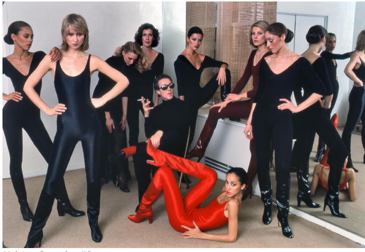
Halston Spandex #2