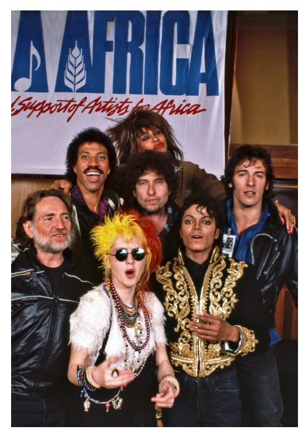
USA for Africa Life cover