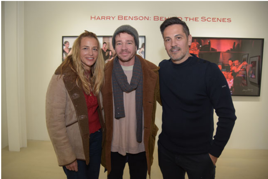
Charlotte Ronson, Nate Ruess, and Michael Landes.