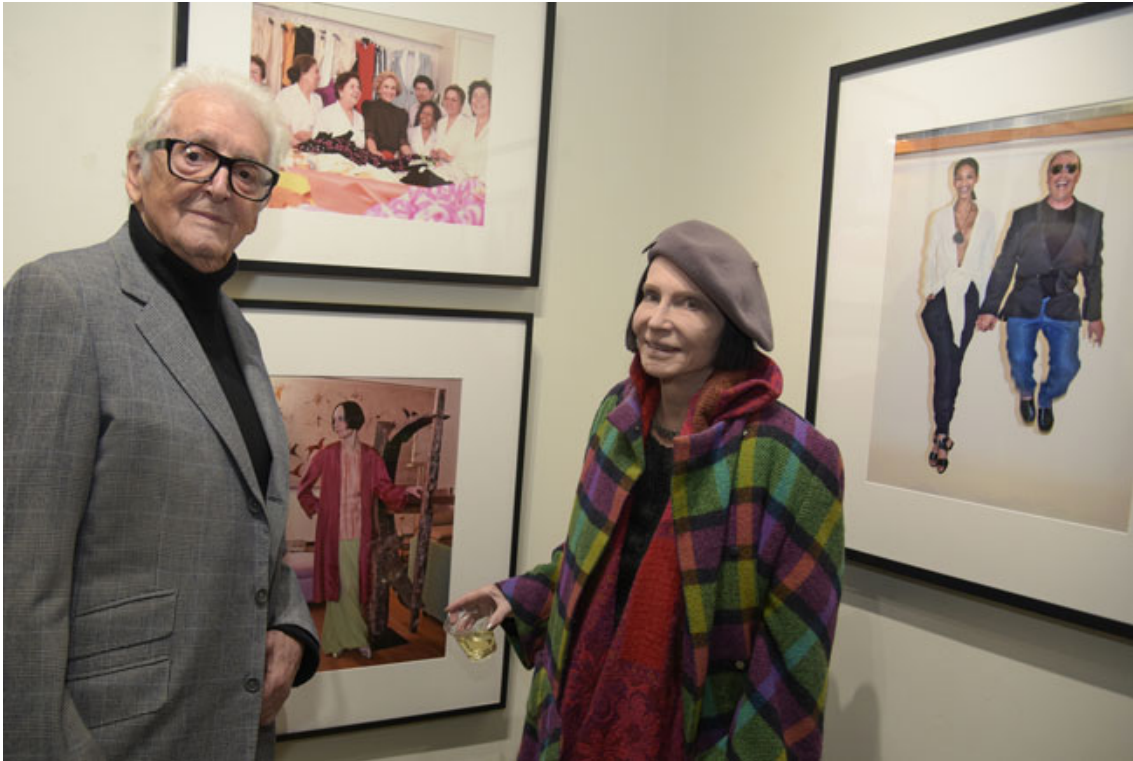
Mary McFadden next to her Benson portrait.