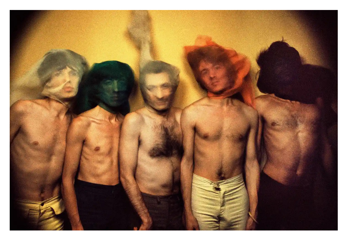
Rolling Stones, Goat Head Soup, 1973, David Bailey

Photo London Photo London 2024 brings together images from 44 cities across four continents, showcasing important works from the dawn of the medium to today. This year's festival includes a solo show of David Bailey's fantastic career. <a href="Photo London 2024">Photo London 2024</a>, is at Somerset House, London, 16-19 May