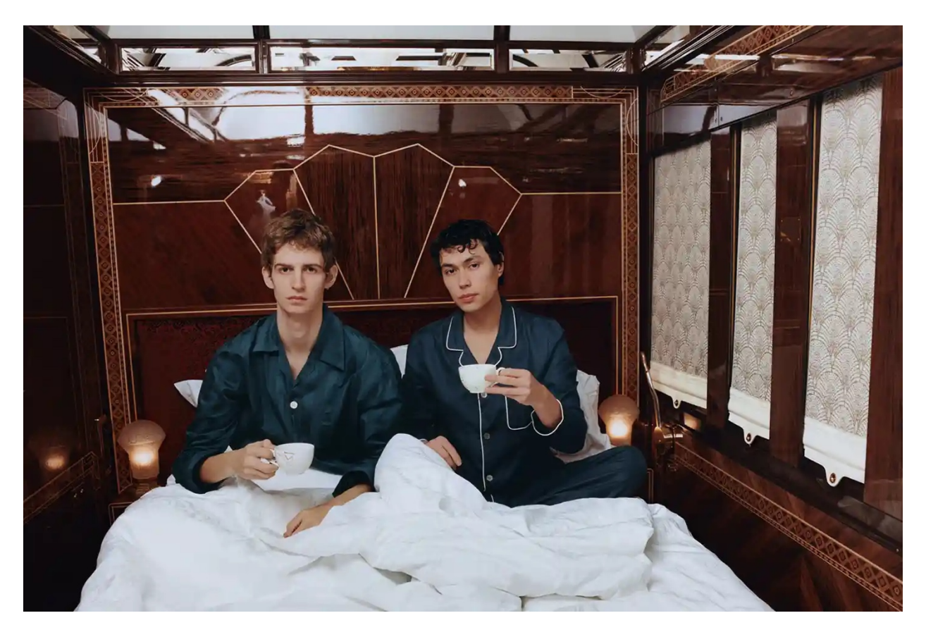
Coffee O'Clock, Venice Simplon-Orient-Express, 2022, Coco Capitán

Belmond, partner of Photo London 2024, returns with Shifting Horizons, a creative endeavour led by and celebrating female photographers exploring contemporary travel