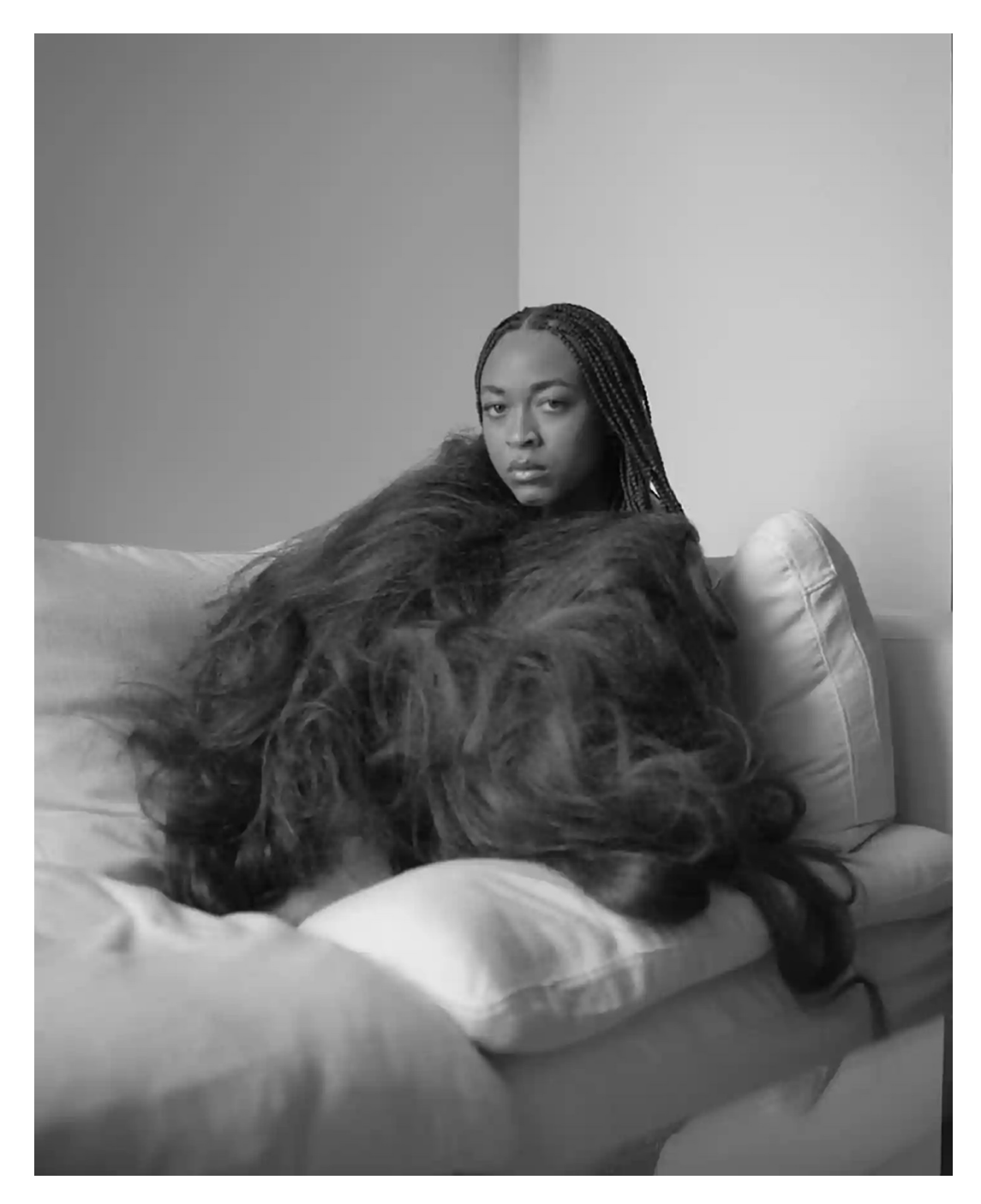
The X-pression Series #1, 2023, Satchel Lee

Body & Soul is a collection of portraiture depicting the reclamation of the Black body, culture and space. The artists featured in this show capture moments of reclamation through photojournalism. It rises above the long and problematic history of Black bodies being seen predominately through the white male gaze in visual culture