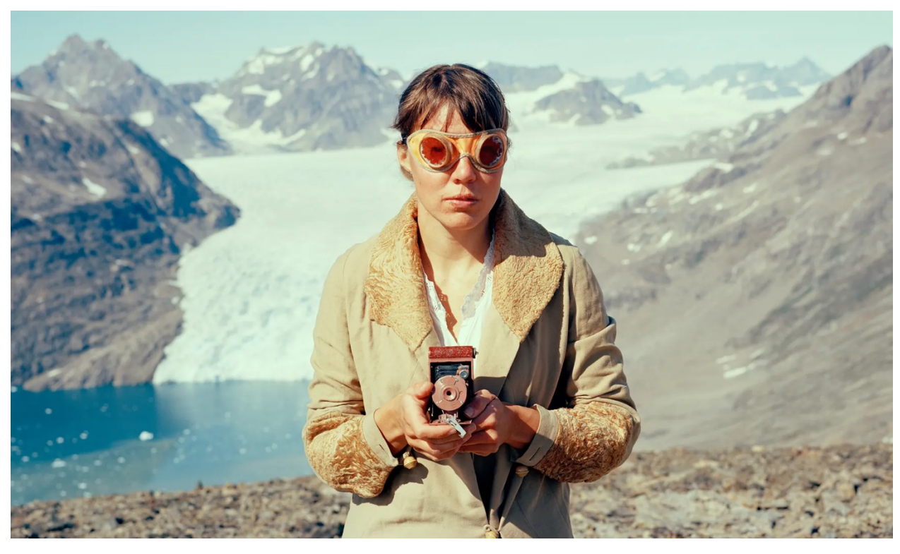
Meticulous re-creations ... Plate 1, Astrup's Horn by Tonje Bøe Birkeland.