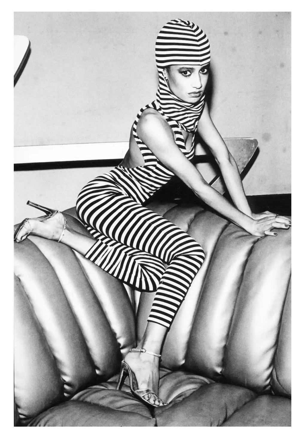
Striped Woman at Studio 54, NY, 1979, Arlene Gottfried

With a focus on classic documentary photography, the artists at Galerie Bene Taschen depict urban spheres and human life at the social edge