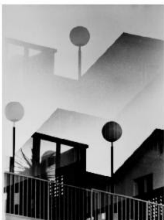
Globes Architecture Black and White, Palm Springs, CA, 1970