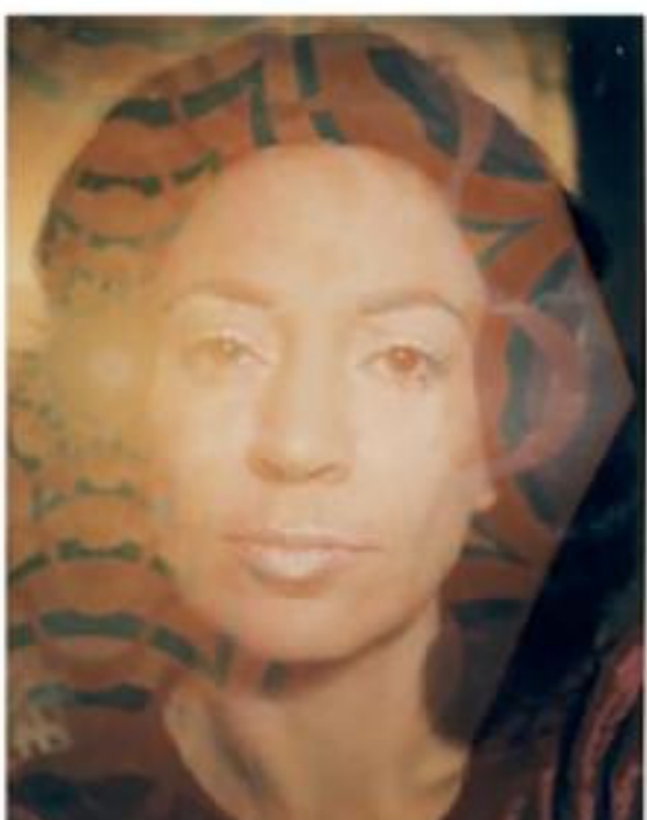
Self-portrait (courtesy of Rugged Entertainment)