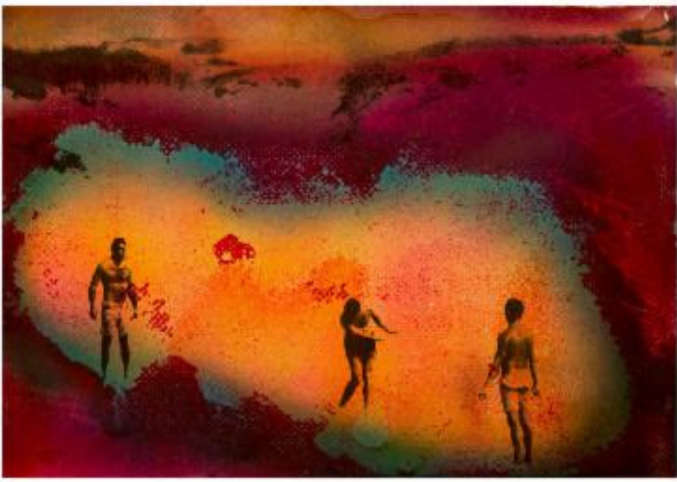
Male Surfers, Carmel, CA, 1967