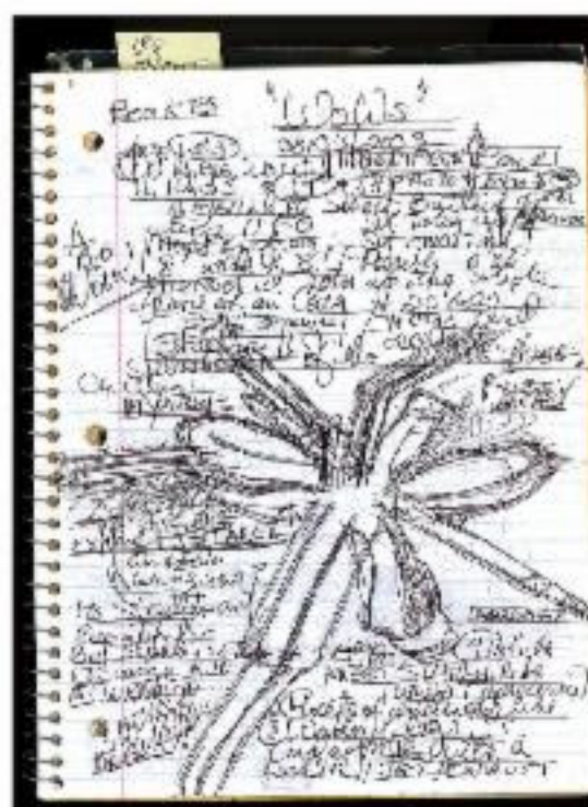
Wow, Alien Entity UFO, Pacific Palisades, CA, August 4, 2003