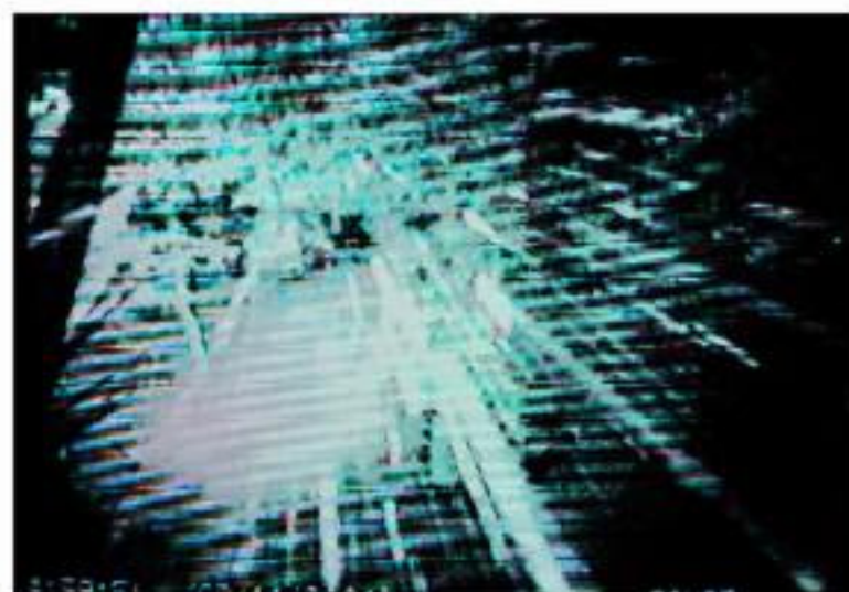
Departure, Pacific Palisades, CA, 2004