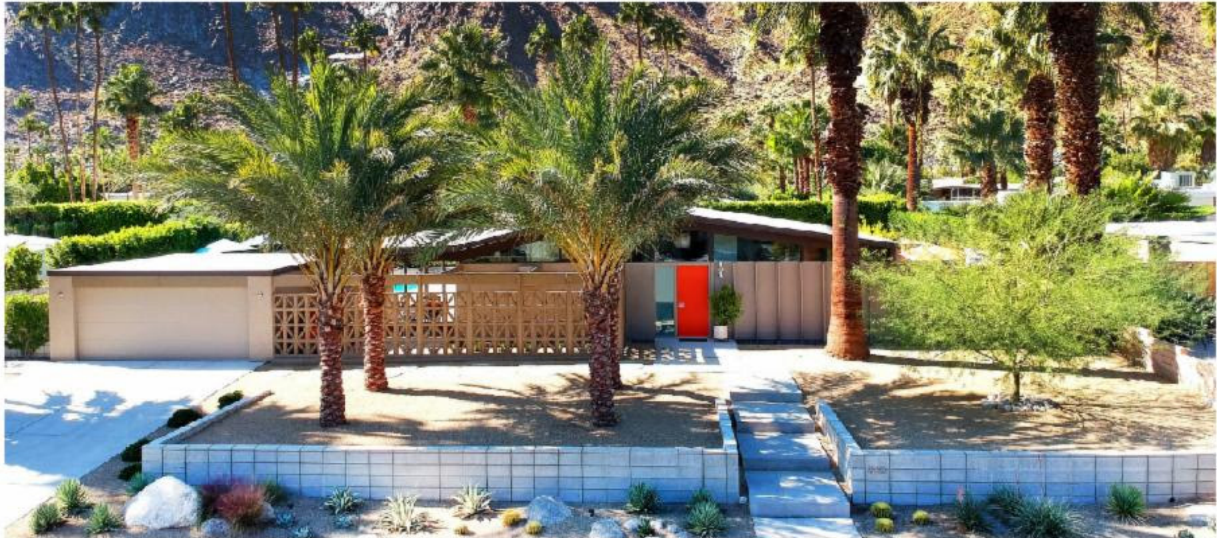
Palm Springs house

Well my mom had two children and she needed to get away and my brother and me we went to boarding school and my mom needed to expand herself whatever she was searching for and she landed in Malibu and she was hobnobbing with Richard Chamberlain and I have a couple snapshots of him with my mom and my mom fit right in because she was a stunner. So my mom rented a place and she was in real estate for a minute and then my mom needed to find a place, through my grandmother's guidance, because my grandmother was the matriarch of the family and she told my mother that Malibu was not a place for her kids. After that, my mother went to Palm Springs and she bought Sandra Dee and Bobby Darin's house and you know you can already feel my mom is starting to break free. Frank Sinatra wanted to date my mom but my mom wanted nothing to do with him.