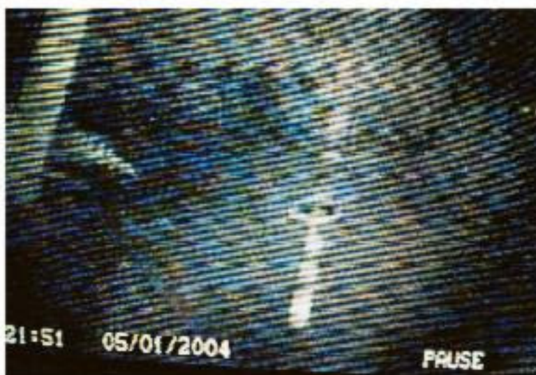
Jet Tail 5, Pacific Palisades, CA, 2003