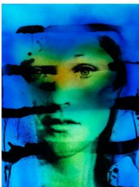
Face (Blue and Green), Palm Springs, CA, 1968