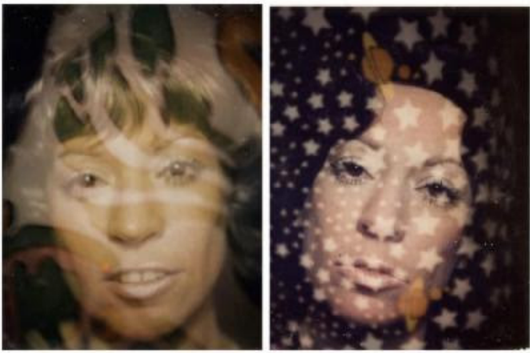
Kali Waves and Kali with Stars, 1972