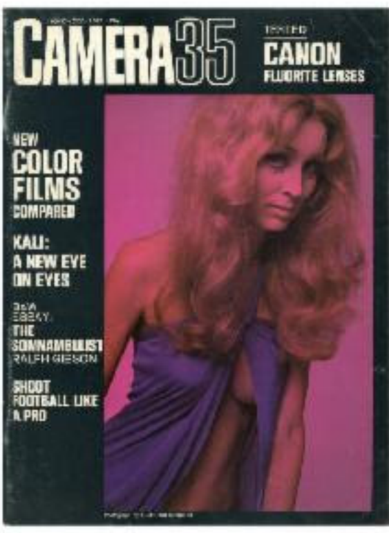
Camera 35, November 1970 cover (courtesy of Kali Artography)