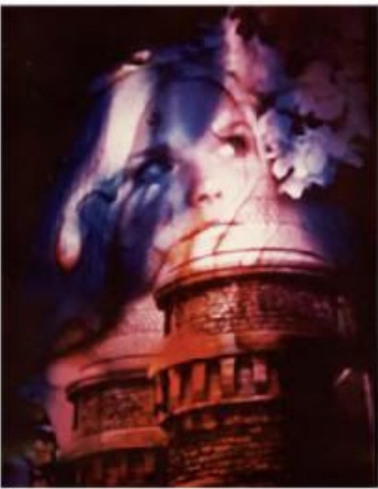
Polaroid (courtesy of Rugged Entertainment)