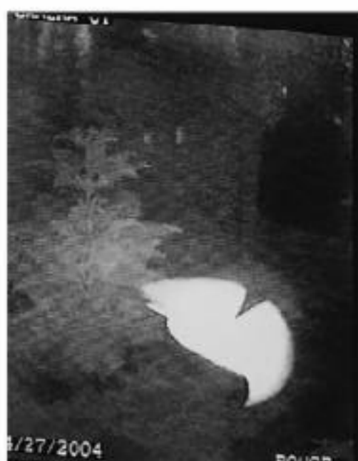
Morphing UFO, April 27, 2004