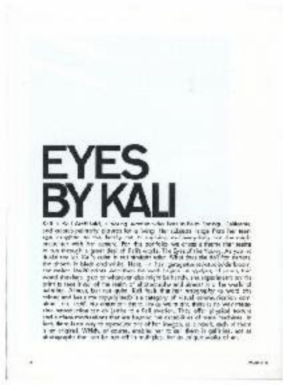
Camera 35, November 1970 intro