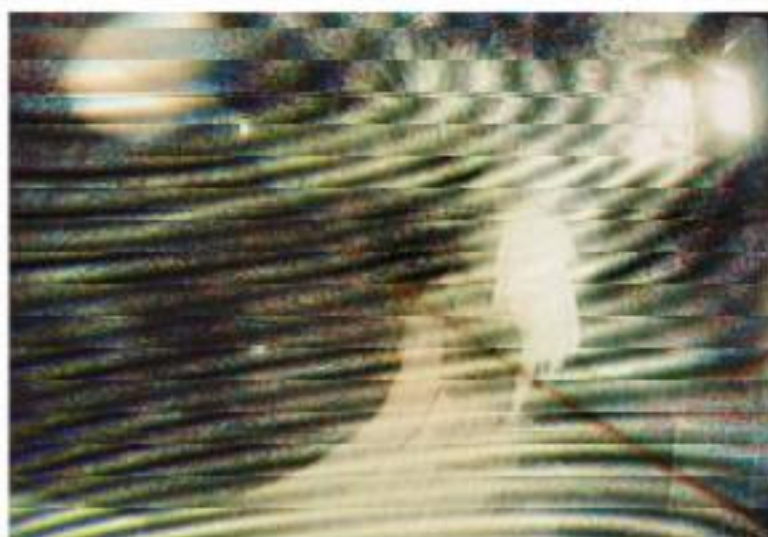
Kali Being Taken, Pacific Palisades, CA, 2004