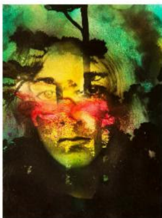
Devendorf Park Hople Model, Carmel, CA, 1967