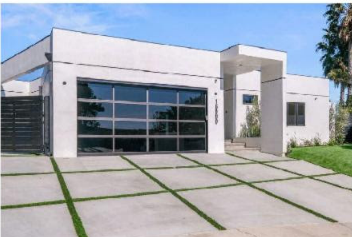
Post remodel real estate listing for 16900 Enchanted Place, Pacific Palisades