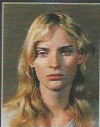
Lens crafter: clockwise from left, Head in Box II , 1995; Girl Drinking Water I , 1994; Portrait of Girl , 1996.