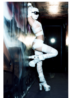
Ellen von Unwerth