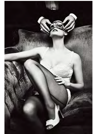
Unmasking, Demi Moore, 1996