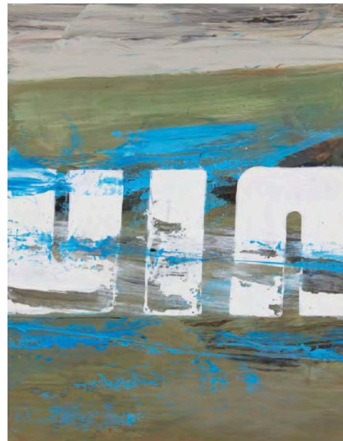
Blunderbust S-130, 2023 Acrylic and oil on aluminum 11x8.5 inches / 27x21 cm