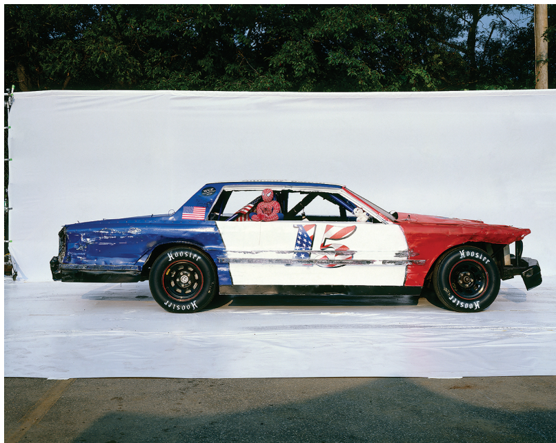
Car 15, Riverhead, NY, 2007 Chromogenic print 20x24 inches / 51x61 cm